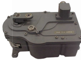
Yaw Trim Servo Actuator