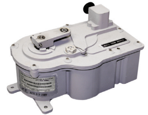
Roll Trim Servo Actuator