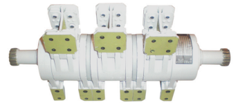
Leading Edge Flap Actuator