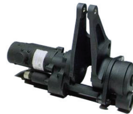
F-18 Canopy Actuator