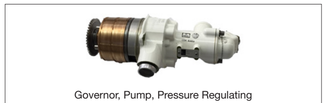
Governor, Pump, Pressure Regulating