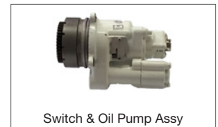
Switch & Oil Pump Assy