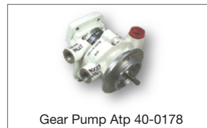
Gear Pump Atp 40-0178